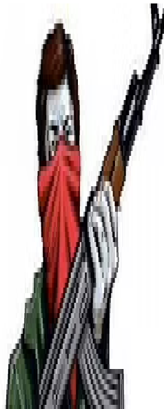
Three CRPF jawans killed in Maoist attack in Odisha's Nuapada