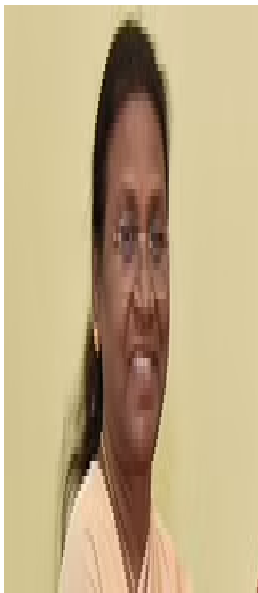
Presidential polls 2022: Odisha leader Droupadi Murmu is NDA's candidate