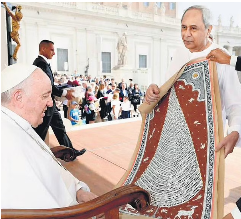
Chief Minister Naveen Patnaik presenting the pattachitra painting to Pope Francis

“On behalf of #Odisha and her people, presented a #Pattachitra which depicts the Tree of Life to His Holiness Pope Francis (@Pontifex) in Vatican City. The unique ancient traditional scroll painting is one of the finest representatives of Odisha’s craftsmanship and artistry,” said another tweet of the CM. Many priests and sisters from India, who were at the Vatican, were glad to see the Chief Minister and wished him well, said a statement from CMO.