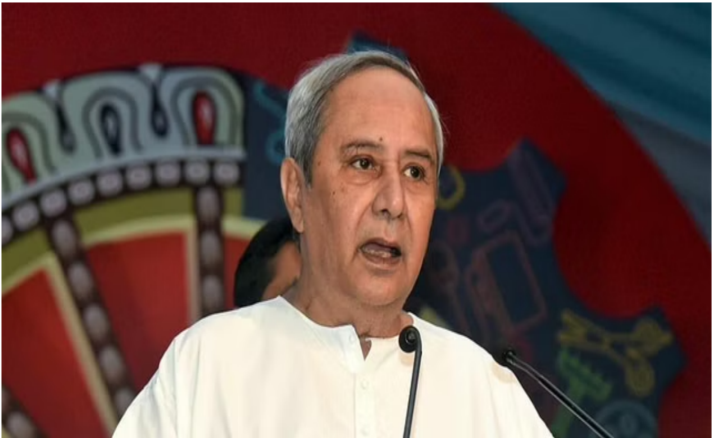
Odisha CM Naveen Patnaik